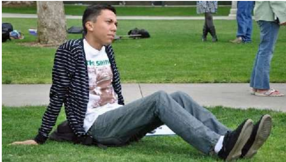
Long Beach State Listener

There is a free speech platform in front of the bookstore. The problem is that it is set back somewhat from the main flow of traffic. There was a man with Greek letters, who confessed to being an agnostic. I rebuked him rather sharply. I offended him, but before he wanted to shake hands with me.